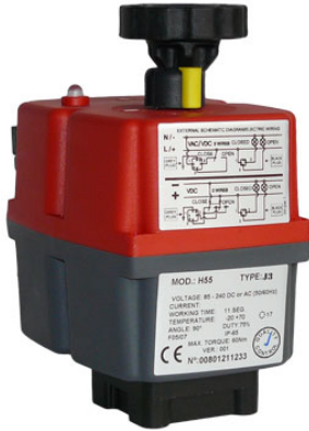
The all new J3 - 55

Visual indication of the actuator's operating status is constantly shown by a highly visible LED light.