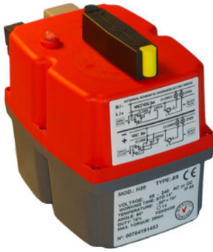
The all new J3 - 20

Visual indication of the actuator's operating status is constantly shown by a highly visible LED light.