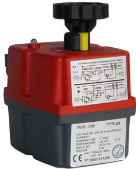
The all new J3 - 35

Visual indication of the actuator's operating status is constantly shown by a highly visible LED light.