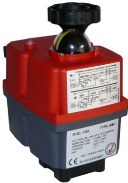
The new J3C - 55 Quarter turn electric valve actuator

Visual indication of the actuator's operating status is constantly shown by a highly visible LED light, and the new highly visible dome indicator, introduced in 2011